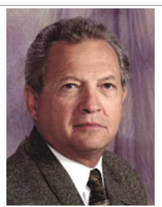
Sen. Mike Bennett (R-Bradenton)

Senator Mike Haridopolos (R-Melbourne) filed the repeal of the substitute communications tax bill (SB 2302). Without this effort, the Florida business community could face thousands of dollars of "new taxes" by allowing the Department of Revenue to adopt rules to tax items never considered under its original intent. Senator Haridopolos is courageously pushing this repeal even though the state still has financial problems. He sees the importance of repealing this tax especially since it is the only one of its kind in the country. Not only would the passage of this bill hinder the growth of companies currently in Florida, but new companies would want to come to Florida with this type of tax on its books. AIF salutes Senator Haridopolos for his leadership on this issue.