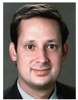
Rep. Joe Negron (R-Stuart)