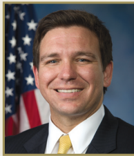
Governor Ron DeSantis Keeping the State Safely 'Open for Business' and Championing COVID-19 Liability Protection