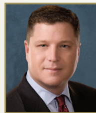
Senator Jeff Brandes (R-St. Petersburg) Civil Liability for Damages Relating to COVID-19