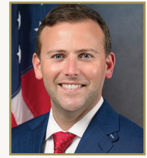
Speaker Chris Sprows (R-Clearwater) Civil Liability for Damages Relating to COVID-19