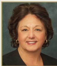
Senator Kathleen Passidomo (R-Naples) Data Privacy Legislation