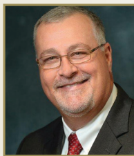
Senator Ben Albritton (R-Bartow) Tolling and Extension of Permits and Other Authorizations During States of Emergency